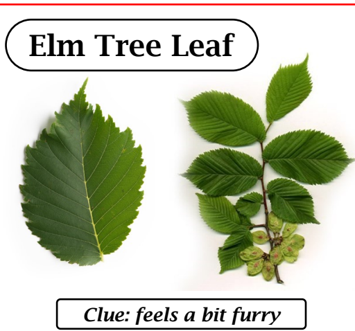
Elm Tree Leaf