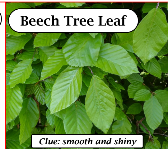
Beech Tree Leaf