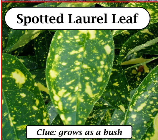
Spotted Laurel Leaf