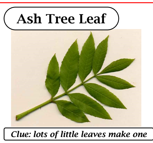
Ash Tree Leaf